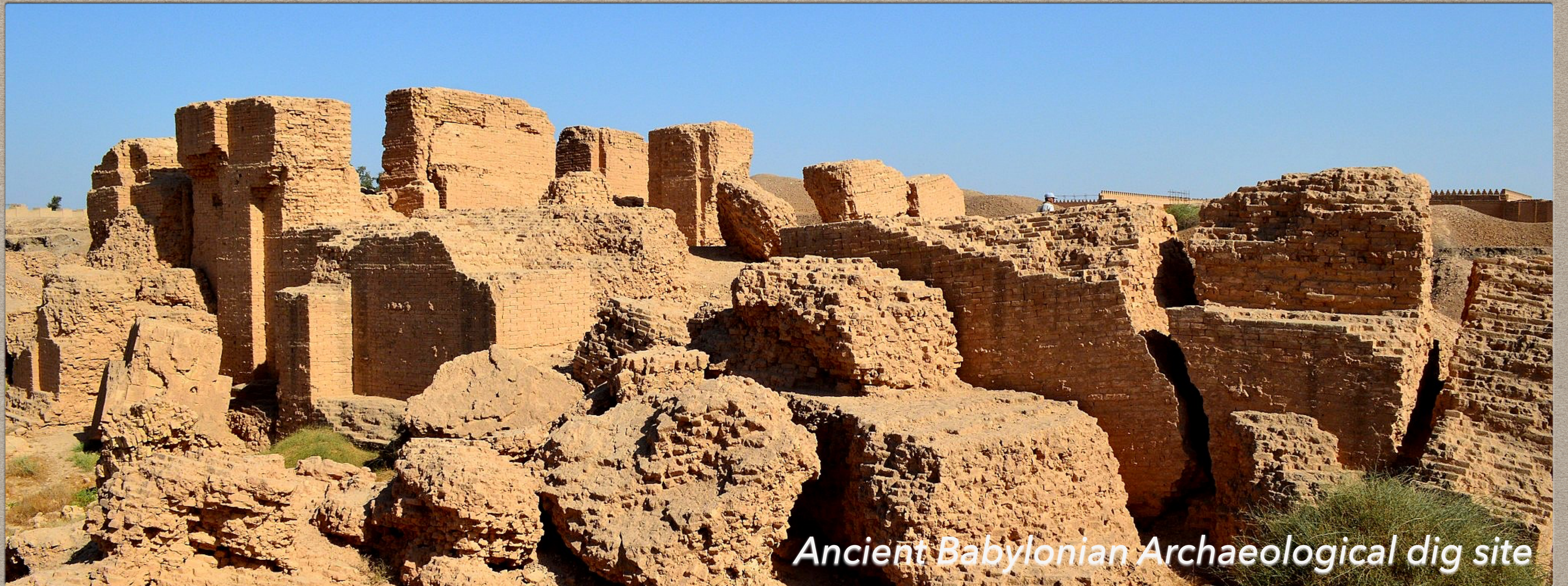
Ancient Babylonian Archaeological dig site